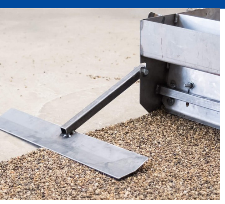
Screed Sledge PRO 24" - The Resin Mill

The Resin Mill are a specialist supplier and one stop shop of resin bound materials. Operating as a one-stop-shop and offering nationwide delivery, we are proud to offer the highest quality UVR resin and a huge selection of resin bound colours, carefully mixed to ensure strength as well as cosmetic appeal. Offering an unrivalled service and sharing all of our install knowledge, we continually promote the highest standards across their permeable paving resin bound industry. We have a dedicated training academy, The School of Resin and have a nationwide approved contractor scheme for homeowners.