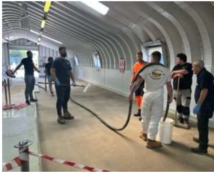
Pictured above:- getting to grips with the art of pumping screeds on day 2 of their training, made possible by the contributions of Markham Pumps (Sheffield) Ltd, Ardex UK Ltd and The Preparation Group Ltd.