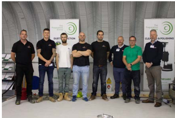
Attendees from Grinding and Polishing Course at The Preparation Group's Training Hub.

This course aimed to give attendees a basic understanding of the processes involved in grinding and polishing resin and cementitious flooring materials.