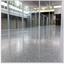
TPS360 & Flowcrete